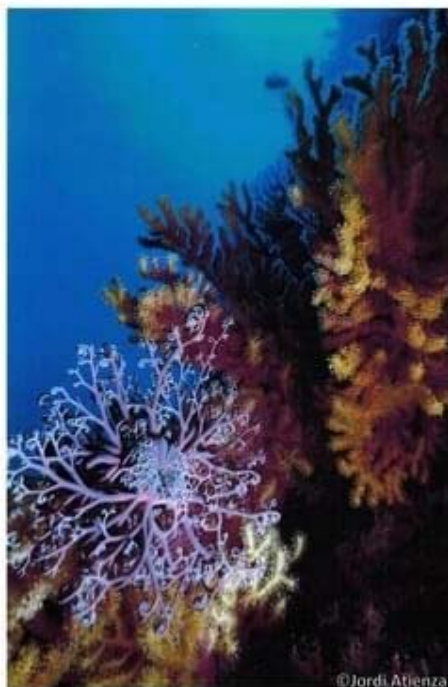
Furió Fitó Depth: 25-50 m