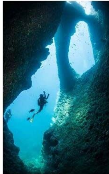
Cova de la Vaca