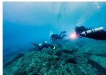
El Gat Depth: 12-56 m