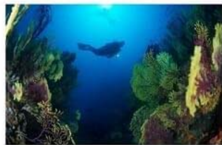
Pedra de Déu Depth: 10-45 m